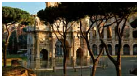
ARCH OF CONSTANTINE